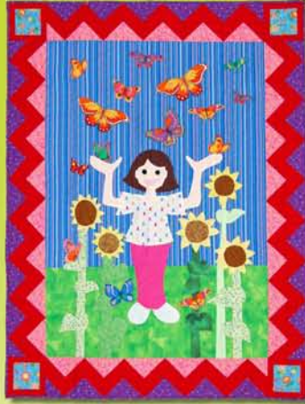
Best of Show - Employee Amy McCanless, AR Emily's Dream