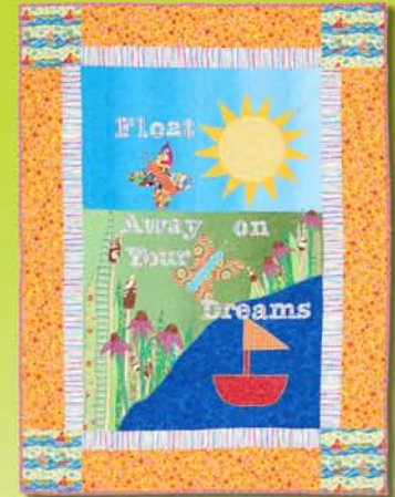
Best of Show - Under 18 Linsey Heister, IA Float Away on Your Dreams