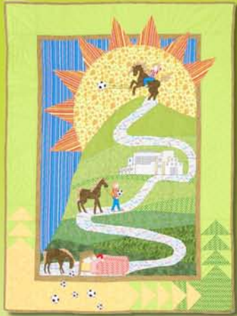
Best of Show - Customer Cheryl Whitcomb, SC Path of Hope